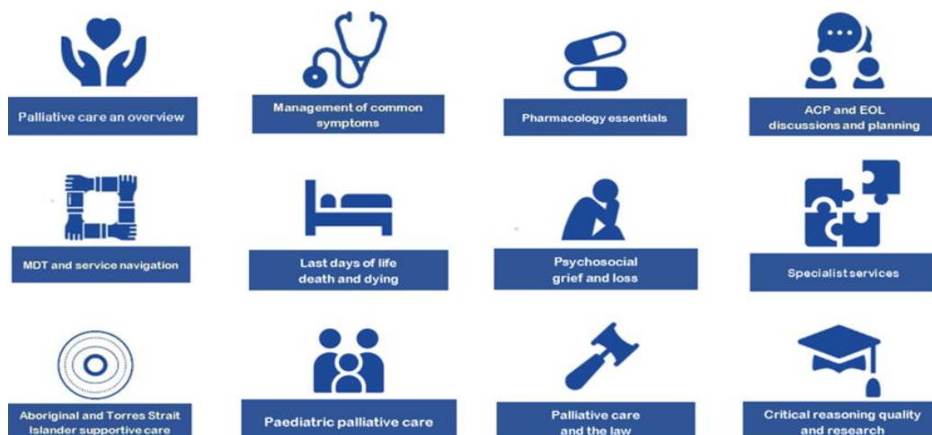
FIGURE 3: CATEGORIES OF EDUCATION IN THE DOMAIN OF PALLIATIVE CARE

A successful feature has been the subsequent development of learning and development pathways for a recognised domain with specified categories of educational activities. These aim to build capacity in the defined domain and identify competencies or capabilities that are required for that domain. All available educational resources are aligned according to whether the clinician/staff member self-assesses as either at the foundational, intermediate, and adept or advanced level based on the NSW Health Capability Framework [6]. These pathways are multi/intra-disciplinary but allows the relevant professional to identify their own learning needs in each specified domain. Palliative Care is an example (see Figure 3).